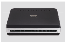
DIR-120 Ethernet Broadband Router

If any of the items are missing, please contact your reseller.