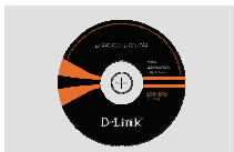
CD-ROM (Quick Router Setup Wizard and Manual)