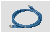
Ethernet (CAT5 UTP) Cable