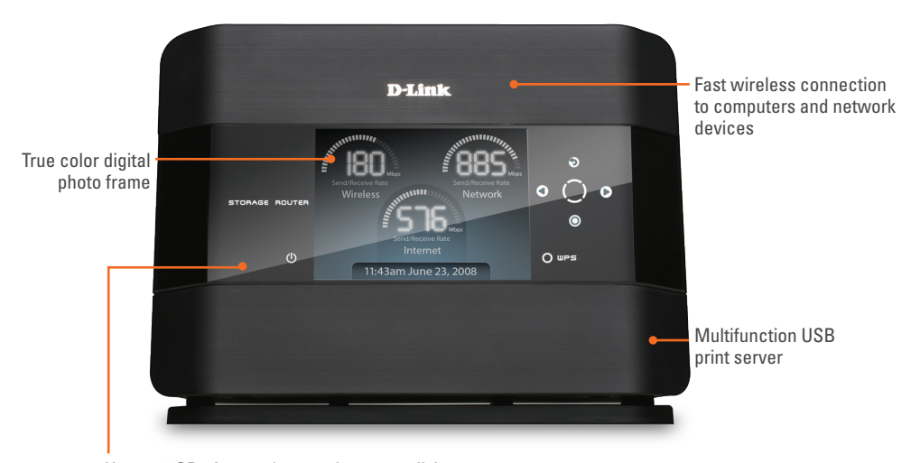
Up to 500GB of central network storage disk space with UPnP AV and FTP server support<sup>3</sup>

The DIR-685 Wireless N Storage Router offers a whole host of functions from one single compact box — including an Internet router, a high-speed wireless access point, network attached storage (NAS), a digital photo frame and a USB print server.