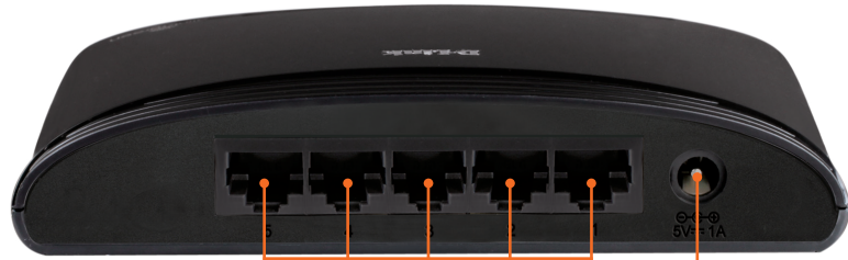
5 RJ-45 10/100 BASE-TX PORTS Connects to computers, print servers, or network storage