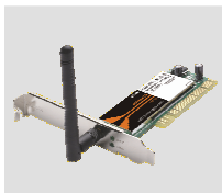
DWA-520 Wireless 108G Desktop Adapter

If any of the items are missing, please contact your reseller.