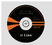
CD-ROM (Installation CD, Manual and Warranty)