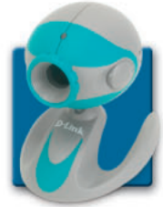
D-Link VisualStream ™ DSB-C110 USB Streaming PC Camera

Enjoy seamless video capture and playback with the DSB-C110. With a refresh rate of up to 30 frames per second, the DSB-C110 delivers smooth and realistic video clips.